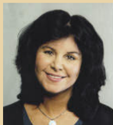
Mavis Leno Women’s Rights Activist