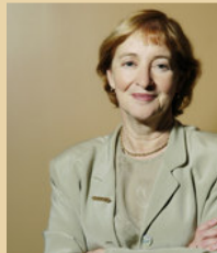
Maude Barlow National Chairperson of Council of Canadians