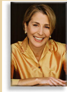
Peggy Klaus Consultant to Fortune 500 companies; Author of “Brag! The Art of Tooting your own Horn without Blowing it”